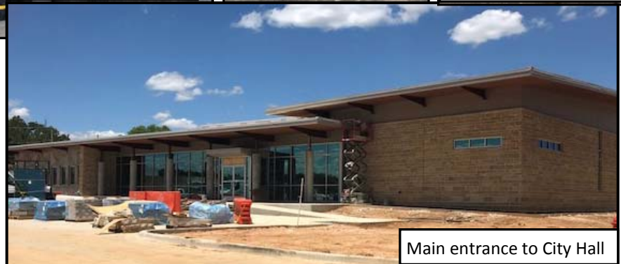
Main entrance to City Hall